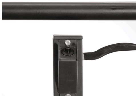
Push button operated electric lift.