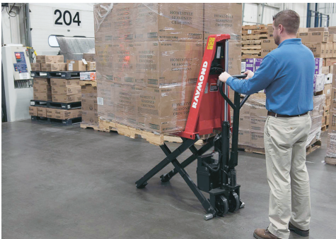
The truck's solid steel scissor legs provide maximum strength and rigidity under load.

Whether the application demands an electric or a manual lift model, the Ergo has your work environment in mind. On the electric lift model, a simple push of a button raises the truck. And with the electric models built in charger, giving the battery a charge is as simple as your nearest 110v outlet.