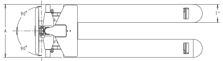
*Fork Length (B): 48"