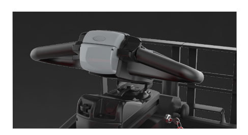
Height-adjustable control handle offers more customizable, comfortable operation.