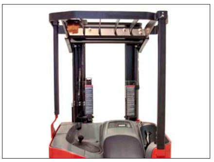
Universal Stack-Stance Configuration