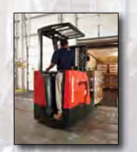
With operator in mind, Raymond designed the Models 4150/4250 stand-up counterbalanced trucks in 2010, offering more visibility and the innovative Comfortstance™ suspension floor.