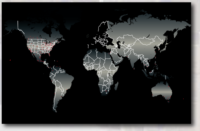
Raymond products are sold and supported by an international network of authorized Sales and Service Centers that provide comprehensive material handling solutions. In North America, 21 sales and service centers fulfill needs through 105 locations. Raymond Sales and Service Centers also service customers throughout Central and South America, Australia, and the Middle and Far East.