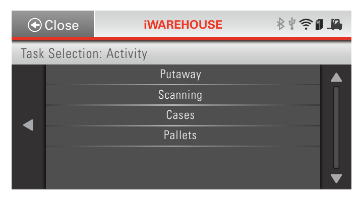
2 | Operators then select an Activity.