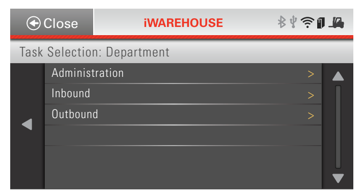
1 | At login, operators are prompted to select a Department.