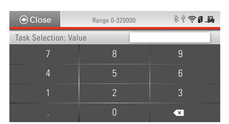
3 | If the task selected involves a count (e.g. pallets or cases picked), the user may be prompted to enter a value. Simultaneously, the system records time to complete the chosen task.